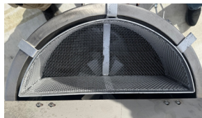
Reinforced Material Strainer