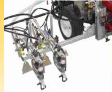
2 spray guns are available on the MMA-Mark 150 and MMA-Mark 250