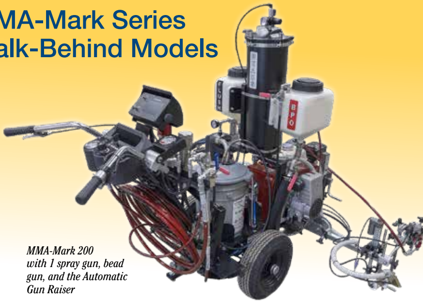
MMA-Mark 200 with 1 spray gun, bead gun, and the Automatic Gun Raiser